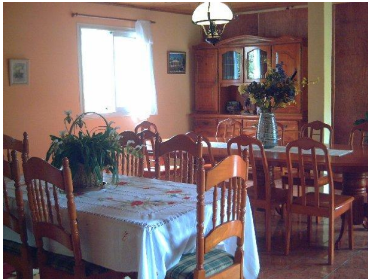
a guest table and guest house in reunion island